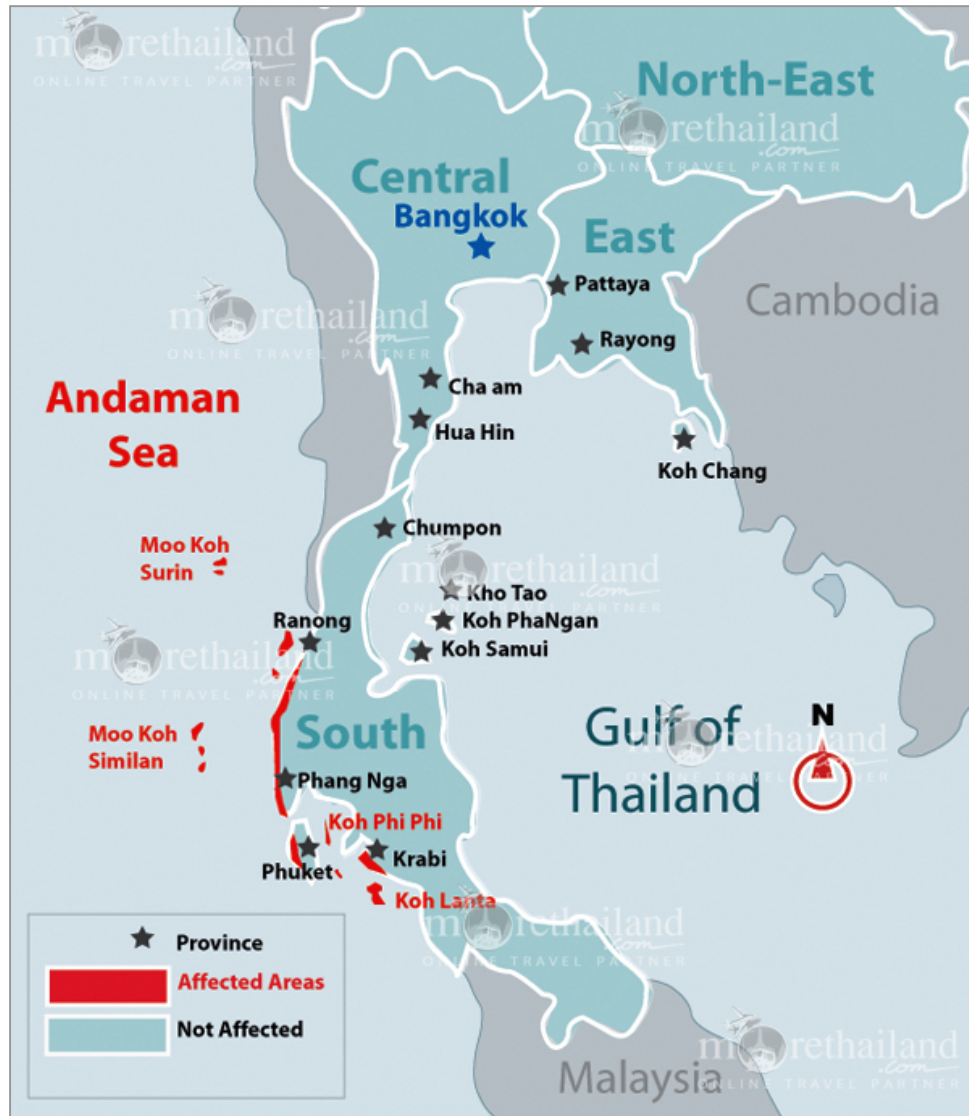
Figure 2: The Map of Tsunami Impacted Areas in Southern Part of Thailand